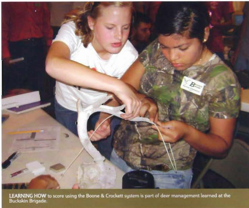
LEARNING HOW to score using the Boone & Crockett system is part of deer management learned at the Buckskin Brigade.

Tell me, and I forget. Show me, and I remember. Involve me, and I understand. – Texas Brigade Motto